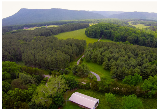
Massanutten Peak from Property