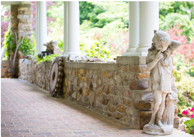
Exquisite Stone Masonry