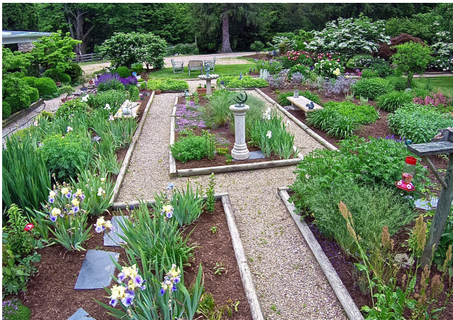
Vast Array of Perennials, Annuals, Herbs, Vegetables