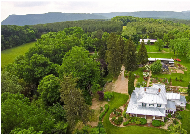
Aerial of house with Massanutten Peak