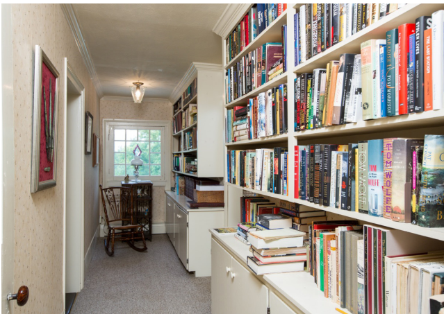
Custom Cabinetry/ Reading Nook