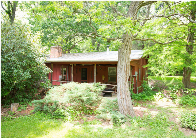
One of 6 Cottages on Property