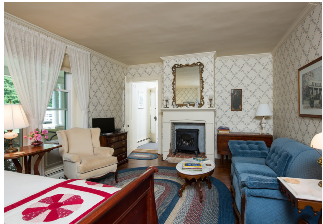
Master Bedroom Downstairs