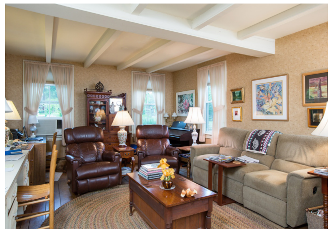
Manor House Living Room