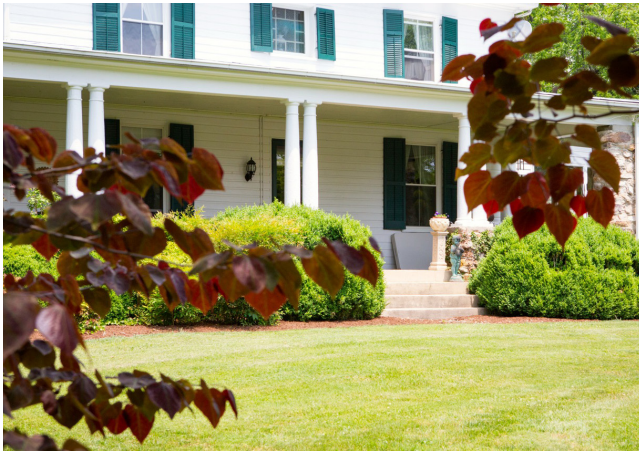
Wrap Around Porch