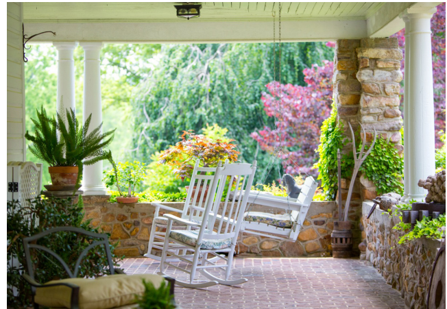
Private Porch Seating Area