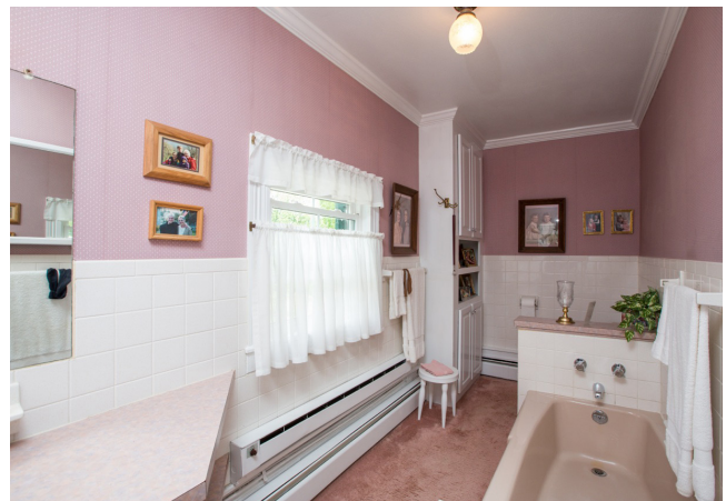
One of 2 Upstairs Bathrooms