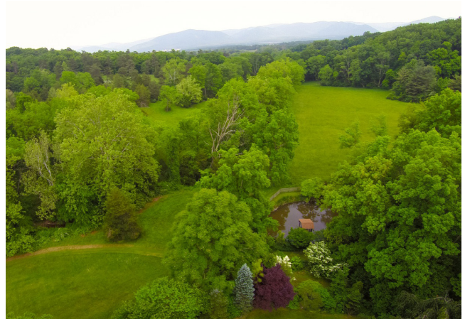
Gently Rolling Topo with Woods