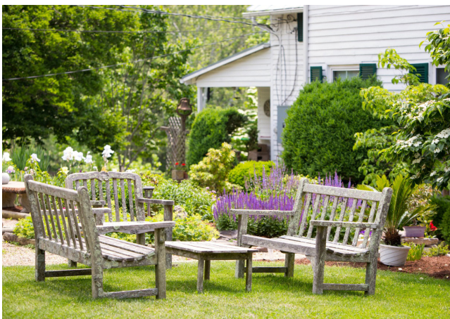
Garden Seating Area