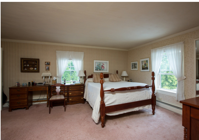
One of 3 Upstairs Bedrooms