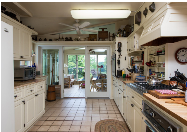
Manor House Kitchen