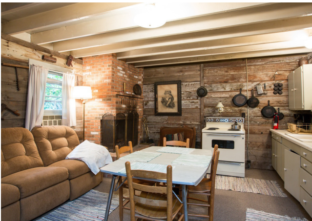
Cottage Living Room & Kitchen